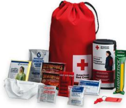
Evacuation Kits Idea List.

In Level 4, you completed your Emergency Evacuation Kit (EEK). This kit might be relatively large and provides needs for a wide variety of potential needs. It may not be practical for this kit to travel with you wherever you go. Most people spend a third of their time, or more, at the office. Consider assembling a smaller version of your evacuation kit that you can keep at work. This kit might be simply a get out of the office and get home kit. It might include food and water but also a pry bar to open doors or break windows, a small fire extinguisher, first aid supplies, flashlight, pocket knife, rope, emergency blanket, dust mask, safety glasses and a whistle. For a list of more content ideas, go to iwillprepare.com > Emergency Kits >